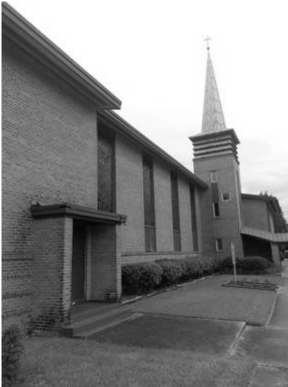
Figure 4. George Pierce and Able Pierce ,Trinity United Methodist Church, Houston, 1951.

Houston built a modern sanctuary designed by George Pierce and Able Pierce in 1951 with dalle de verre windows derived from Afro-American quilting traditions. 8 But Chase clearly articulated the reasons a congregation who is in some way marginalized—minority congregations, immigrant communities, or churches in rural towns—might have chosen to “get away from traditional styles and incorporate modern materials to produce an economical building, expressive of its purpose.” 9