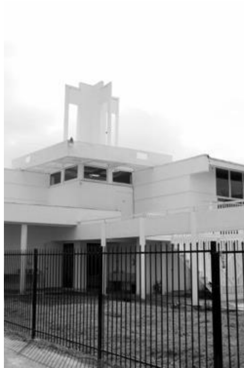
Figure 27. Rudolph Schindler, Bethlehem Baptist Church, Los Angeles, 1941, photo taken Easter 2014, after restoration.

The city Cultural Heritage Board first assessed the building in 1972. The Cultural Heritage Committee of the AIA opined, “since the building was constructed under a very low budget, it was not one of R.M. Schindler’s best works.” 83 This assessment disregards both the significance of broadening the accessibility of Modernism and a defining characteristic of Schindler’s architecture. In 2009, the city declared the church to be a Historic-Cultural Monument. At the time it was