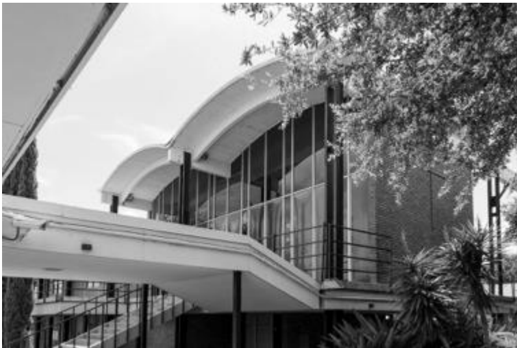
Figure 23. Caudill Rowlett and Scott, St. Joseph Academy Chapel, Brownsville, 1959.