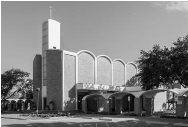
Figure 24. Wayne, Gibson & Martin, Minor Seminary, Corpus Christi.

In the 1960, space age thin shell concrete structures flourished in the Coast Bend region, in part because they were “resistive to the area’s corrosive humidity.” 54 An article touting the revolution in a 1963 Texas Architect included Parkway Baptist Church, the Minor Seminary in Corpus Christi and a Knights of Columbus Hall in Alice.