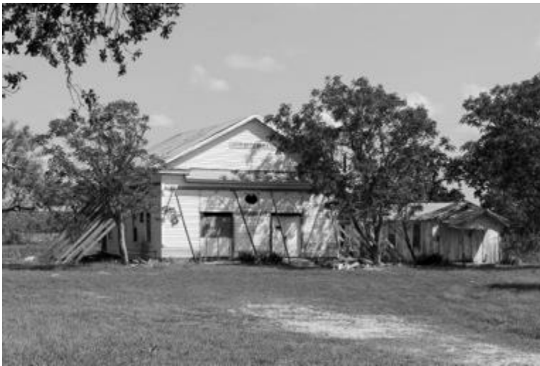
Figure 5. Capote Baptist Church, Guadalupe County, 1874.

landscape architect involved with the restoration, describes the footings as “specifically shaped according to their particular locations, interior, corner and perimeter. It’s obvious that African-American knowledge of local construction materials and techniques has been underestimated.” 33