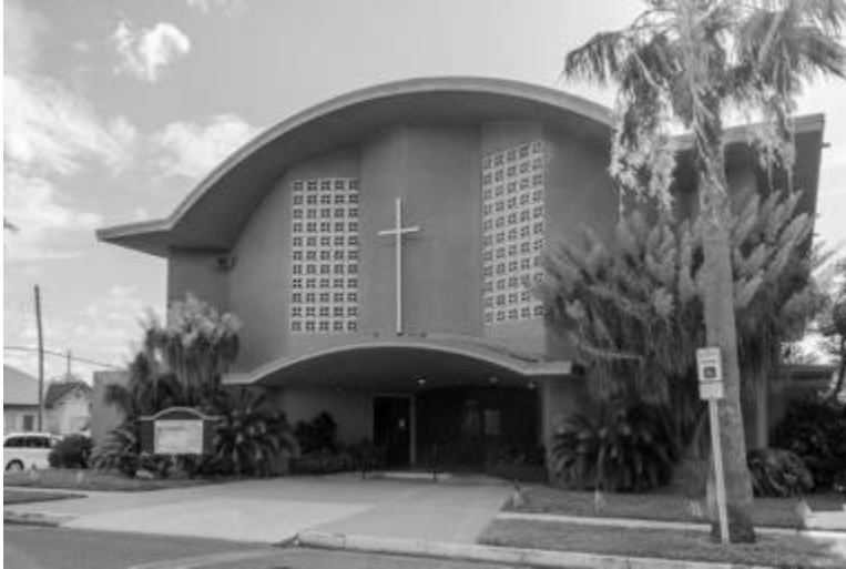
Figure 21. St. Paul, Mission, 1960.

tooth perimeter walls with masonry unit brise soleil , or St. Anthony in Columbus, with its expressed economical portal frame and industrial free-standing campanile, reflect the influence of international church design in modest applications.