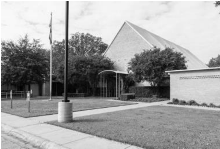
Figure 8. O'Neil Ford, First Christian Church, Denton, 1958–59.

First Christian Church (Disciples of Christ), another Denton church designed by O'Neil Ford, also displays an explicit union of conventional geometry and progressive architecture. 37 Ford worked with Félix Candela 38 on the distinctive thin shell concrete roof structure. Unlike the typical monolithic saddle roof application of the form, here Candela applied a hyperbolic paraboloid roof to the traditional bayed structure of the Christian basilica within the simple profile of the "Texas basic." As a result, a dynamic undulation occurs within the profile of the humble simplicity of the vernacular country church.