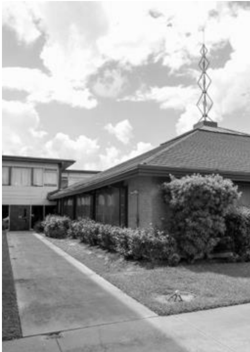
Figure 1. John S. Chase, St. John Missionary Baptist Church (Dowling Street) Education Building and Malone Chapel, Houston, 1963.

Elements of the program and design features outlined in the thesis carried into John Chase's professional work, such as the Education Building for the historic St. John Missionary Baptist Church, Houston, a 1950 yellow brick classical revival building. Chase's 1963 addition featured a square chapel with a pyramidal roof