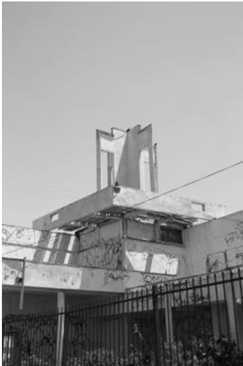
Figure 26. Rudolph Schindler, Bethlehem Baptist Church, Los Angeles, 1941, photo taken May 2012, prior to restoration.