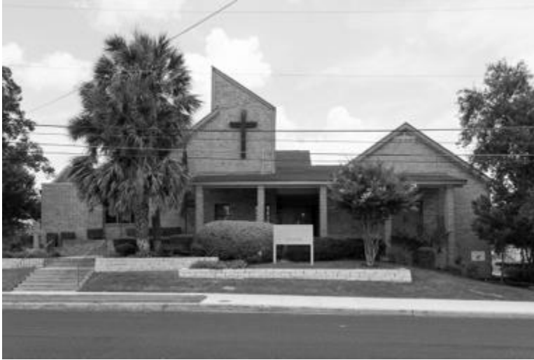
Figure 19. Leo Danze, Holy Cross, Austin, 1979.