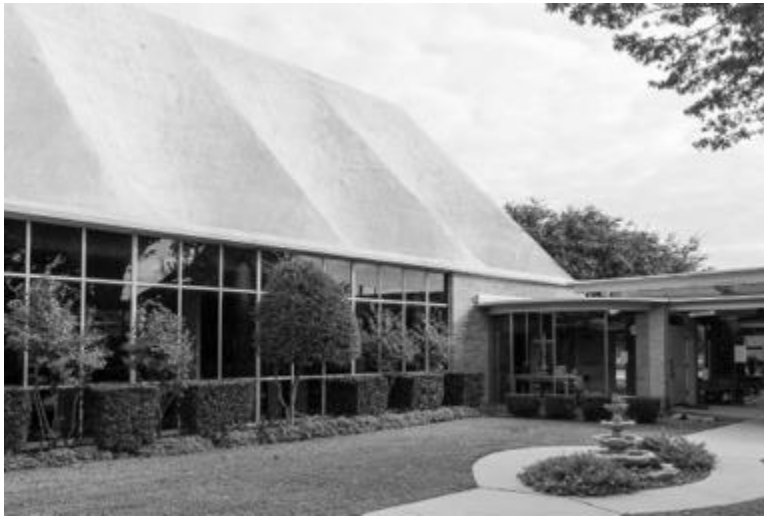
Figure 9. O'Neil Ford, First Christian Church, Denton, 1958–59.