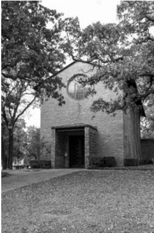
Figure 6. O'Neil Ford and Arch Swank, Little Chapel in the Woods, Denton, 1938-39.

The Little Chapel in the Woods on the campus of the College of Industrial Arts (now Texas Women's University) demonstrates the confluence of vernacular and modern architecture in the work of influential Texas architect O'Neil Ford. Ford and Arch Swank designed the building to be built with unskilled labor from the National Youth Administration as well as students and faculty of the college. 35 Amidst the common building methods typical of depression-era public works projects, they based the structure and spatial definition on massive parabolic arches—a union of