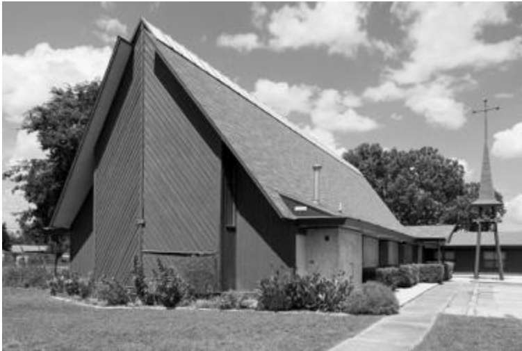
Figure 11. St. Philip Episcopal, San Antonio, 1963.

Lawrence A. Collins, African-American architect and professor at Prairie View A&M University, designed a similar church for Pilgrim Congregational United Church of Christ in Houston in 1971. The abandoned Beaux-Arts modern Sixth Church of Christ, Scientist, opposite Houston's Emancipation Park in an area under development pressures, sold to developers in March 2014.