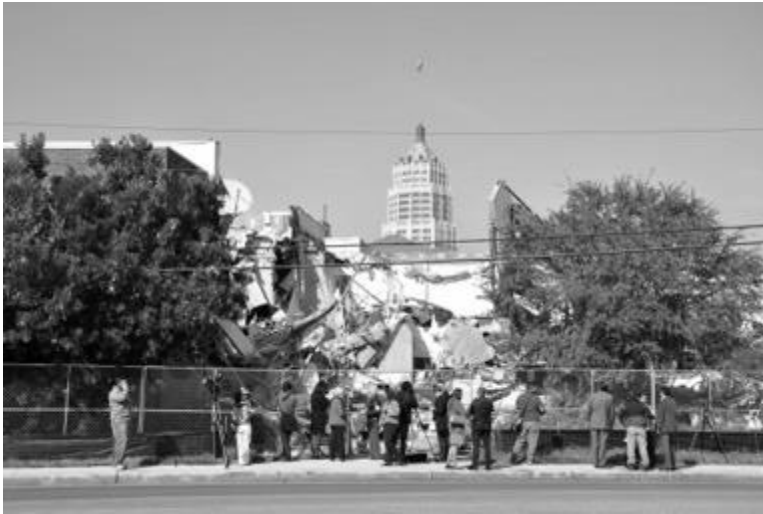
Figure 25. Demolition of the Univision Building, San Antonio.

Its demolition represented a failure of the preservation process. According to activists fighting for the building’s preservation, city officials “expressed the opinion that the building was ugly, ignoring—or perhaps ignorant of—the guidelines used to determine historic significance, guidelines in which aesthetics play no role.” 72 The city disregarded input from preservation experts, community groups, and the state commission in favor of economic development. This case raised the question of what we expect history to look like, whether it is an unrecognized style or it is the history of another culture.