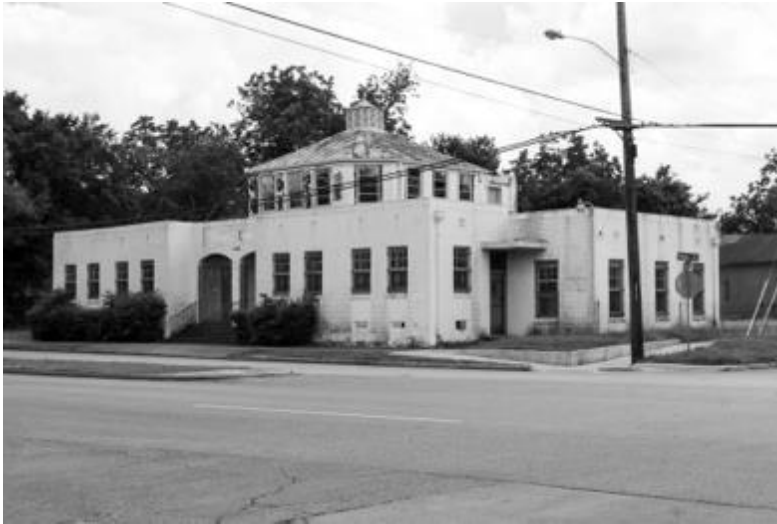
Figure 12. Sixth Church of Christ, Scientist, Houston, 1941.