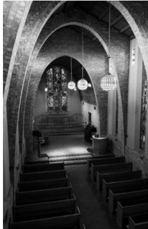
Figure 7. O'Neil Ford and Arch Swank, Little Chapel in the Woods, Denton, 1938-39.