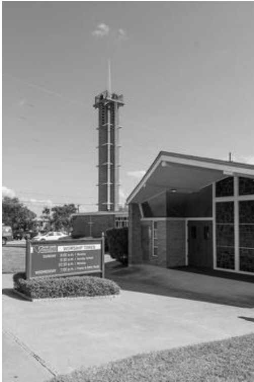
Figure 3. John S. Chase, David Chapel, Austin, 1959.

lacking in most contemporary buildings, and a large community room separated from the sanctuary in part by a movable partition. An open brick and metal cruciform frame tower, frameless beveled corner glazing, and glazed walls with solid colored planes—a feature common in African-American Baptist churches, but here in a de